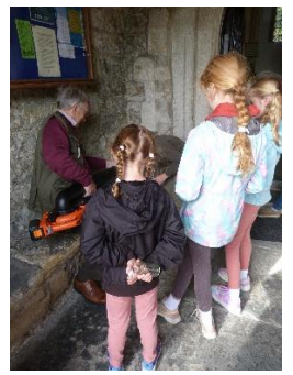
Inspecting the contents of the vacuum sweeper