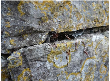
The noble false widow spider

His electric toothbrush was demonstrated on a garden spider's web, and, hey presto, one appeared in the centre of the web. Our children experimented with his toothbrush and one coaxed the noble false widow out of its lair in a crack in the wall. A demonstration of the vacuum leaf extractor revealed money and sac spiders, a wolf spider and a nursery web spider.