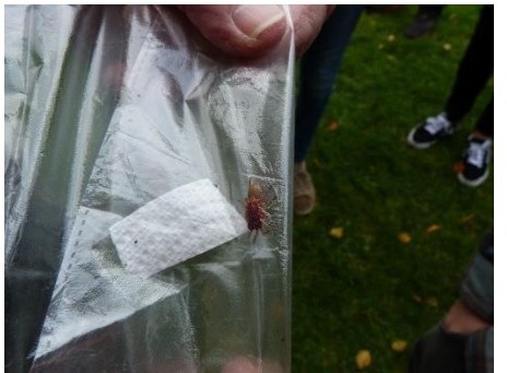
The amazing red woodlouse spider

Francis explained that the money spider was unusual because it operates underneath its web when it catches prey. Finally, a woodlouse spider was unearthed beneath a flat piece of stone where it was resting in its dense web before the night hunt.