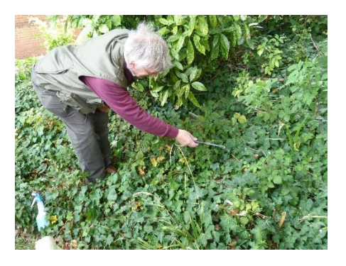
A garden spider is coaxed out

His electric toothbrush was demonstrated on a garden spider's web, and, hey presto, one appeared in the centre of the web. Our children experimented with his toothbrush and one coaxed the noble false widow out of its lair in a crack in the wall. A demonstration of the vacuum leaf extractor revealed money and sac spiders, a wolf spider and a nursery web spider.